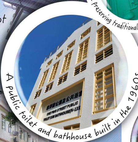
A public toilet and bathhouse built in the 1960s