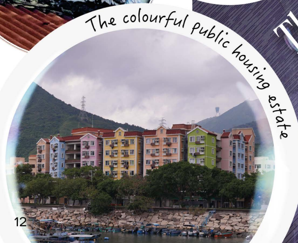
The colourful public housing estate