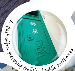
A post office preserving traditional public postboxes

Although the restricted area is not open to the public, visitors may still weave their imagination around the history of the mysterious area.