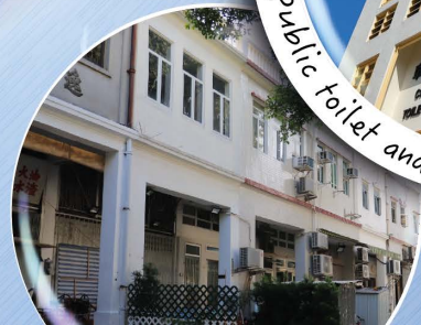
San Lau Street