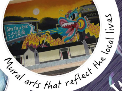
Mural arts that reflect the local lives